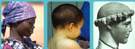
Examples of good neck alignment

Populations with very little muscle and joint pain still exist. By studying these groups, as well as looking to our ancestors and revisiting how we moved as toddlers, we can all reclaim the healthy structure that lies within us.