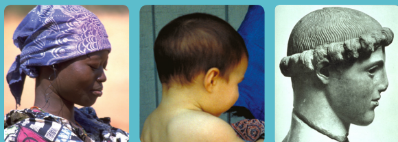
Examples of good neck alignment

Populations with very little muscle and joint pain still exist. By studying these groups, as well as looking to our ancestors and revisiting how we moved as toddlers, we can all reclaim the healthy structure that lies within us.