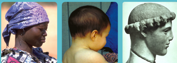
Examples of good neck alignment

Populations with very little muscle and joint pain still exist. By studying these groups, as well as looking to our ancestors and revisiting how we moved as toddlers, we can all reclaim the healthy structure that lies within us.